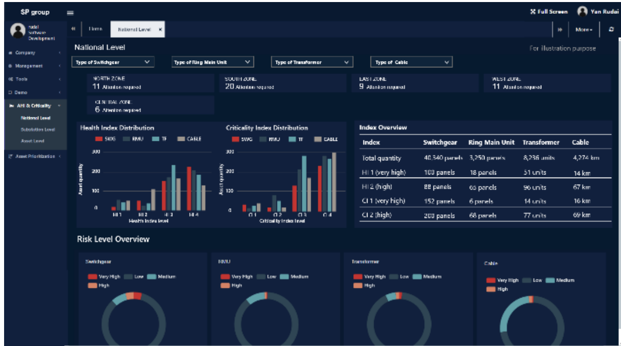
Overview of Asset Health and Criticality Index for the Distribution Network